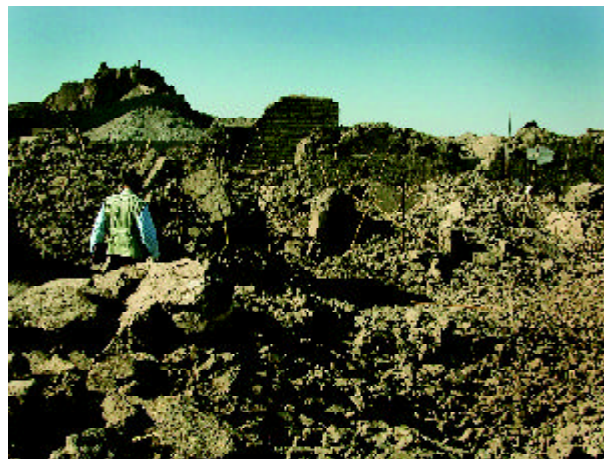
Figure 13. Ruins of the Grand Mosque. The north-west section of the main courtyard was on the right side of the view.

earthen complex, it was, of course, difficult to come up with a single theory that could explain the nature and extent of the damage. I had expected to experience the kind of damage described by the Getty Seismic Adobe Project with the classic signatures of structural weaknesses inscribed on them: shear "X" cracks, cracks propagating out from the tops of windows and doors, collapsed corners, overturned walls, etc. However, in the Arg, even the usually common diagonal or "X" cracks were relatively rare. It appeared as if the structures had exploded from the inside and crumbled straight to the ground in a scatter of small pieces. Rubble was everywhere. It formed a mat of broken material that in some places was almost as high as the still-standing remains of the walls. The previously completely restored Grand Mosque, for example, was completely unrecognizable after the earthquake. In the rubble pile, there was even barely enough left intact to discern the outline of what had been its large courtyard, see Figure (13).