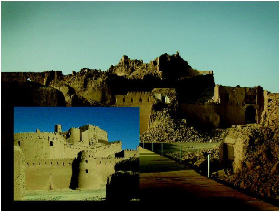
Figure 1. The Arg-e Bam upper citadel before and after the earthquake. Before photo by James Conlon, 2003.