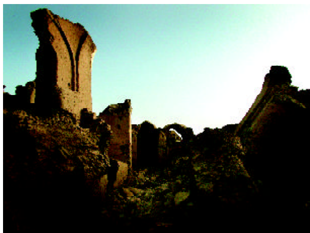
Figure 4. View of the ruins of the Arg-e Bam.

What occurred to cause all of this? Is it explained by the intensity of the shaking alone? In a comprehen-