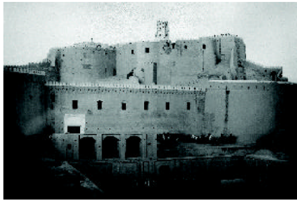
Figure 6. Late Qajar Period (19th Century) view showing soldiers in the inner citadel.

Beginning in 1953, the site became recognized as a nationally significant historic site and a gradual process of conservation and restoration began. Most of the restoration work has been carried out over the past 25 years. Some of the ruins in the shadow of the military citadel were restored back into complete buildings. The final step in this restoration process was to plaster the exterior surfaces with a layer of mud plaster reinforced with straw. Most of this modern-day restoration work appears to have been done with square sun-dried bricks, rather than in chineh.