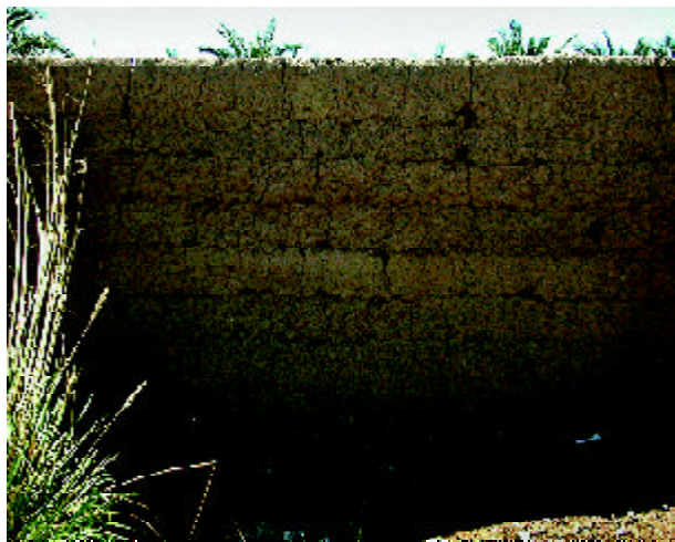
Figure 23. Chineh garden wall, probably of recent origin, in Baravat (near to Bam). This wall shows the cracks that commonly exist in chineh walls, and how the layered construction helps to ensure stability by allowing the cracked sections of the mud layers to perform like large blocks of masonry.

clay that are about 50cm high that represent each “lift” in the construction process. These lifts were constructed along the wall from one end to the other, and then made smooth and level on the top before proceeding with the next lift, see Figures (3), (5), (23) and (24).