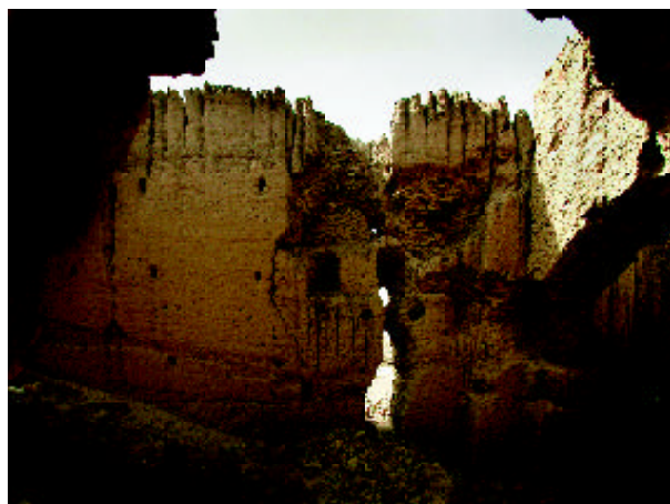
Figure 20. The interior of the unrestored "Shahrbast Wall" showing 3-story high walls that survived the earthquake. Notice the older section with later work constructed around it. This is a good example of the onset of damage at the interface of construction of different age and type, as a small area of collapse has revealed this interface. Notice the debris on the ground.

All of this evidence taken together seems to point