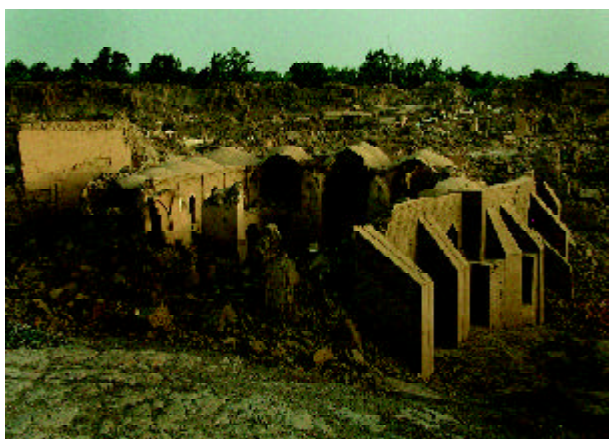
Figure 19. The ruins of the Caravansary show that the domed rooms on the second level behind the buttresses have collapsed, while the ones opposite still remain. There are no buttresses behind the external wall of the opposite side. The base of the 5th buttress is crushed.

The story of this complex became even more interesting when I learned from the old photos that the side that collapsed had been almost completely reconstructed only a few years earlier, whereas the still standing side had mostly survived from antiquity. In aerial photographs of the caravansary taken in 1974 [10], the domes on the east side were almost completely intact, whereas on the west side they had collapsed. At that time, the buttresses on the west side only extended up to the level of the first floor. As late as 1996 the condition of both sides was similar to 1974, except that the small holes in the east side domes had been fully repaired [11].