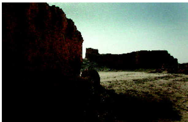
Figure 3. Unrestored ancient earthen structures including the Shahrbast Wall in the distance after the earthquake. These structures were only lightly damaged.

nevertheless remarkable. There have been few past earthquakes to prepare one for the extent of the destruction seen both in the Arg and in the modern town adjacent to it. There was hardly a single building type, ancient or modern, that did not suffer total destruction. Even many of the steel frame buildings constructed over the last decade ended up with their steel frames wrapped into shapes like pretzels on top of heaps of crumpled infill masonry walls and floors. In the case of the ancient Arg, little remained that resembled complete buildings. A sea of formless rubble extended out as far as the eye could see (Figure (4) and (13)). Even the Governor's House and Tower astride the hill that formed the central symbolic image for the site disappeared, leaving behind ruins that resembled a natural rock outcropping, untouched by human hands, see Figures (1) and Figure (29) for location of sites.