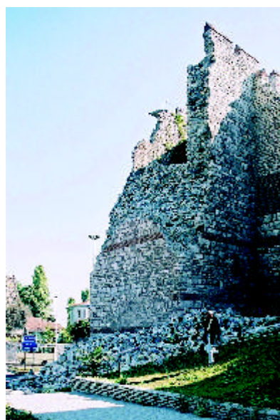
Figure 27. The reconstructed tower that collapsed during the 1999 earthquake. The bands of red brick on the wall were fake veneers, rather than full layers.