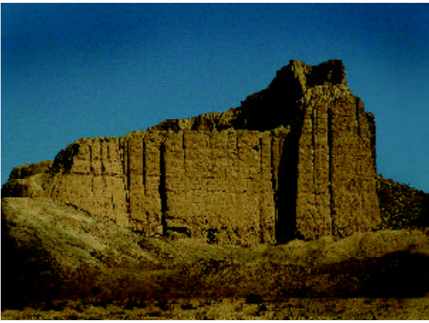
Figure 28. The unrestored Khale Dokhtar, a small Arg (or citadel) on the riverbank opposite the Arg-e Bam that survived the earthquake with the collapse of some arches. The high walls of the massive structure otherwise survived intact (Termites and other insects were also in evidence where the collapses occurred.)