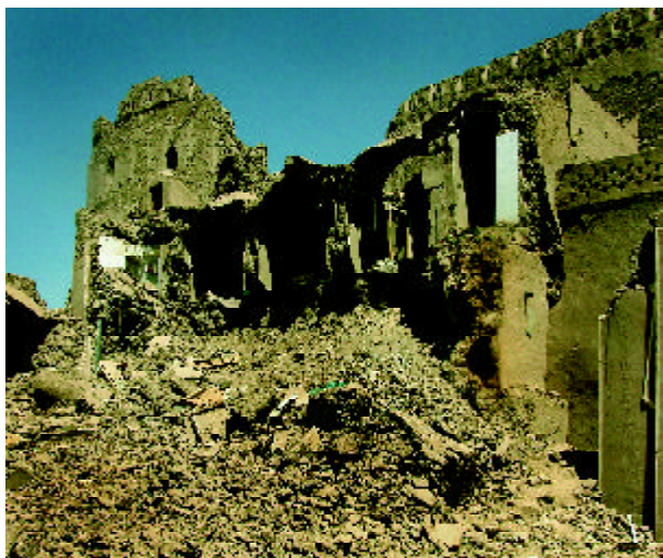
Figure 14. Buildings above the Stables courtyard that collapsed from the lateral spreading failure of the retaining wall and fill beneath.

The more we examined the site, the more compelling this explanation became. In a number of locations there was evidence of lateral spreading of the kind that one would expect to find around the shore of a lake - but in this case it was located on dry ground where historically the surface had been built up to create the level terraces on which the buildings were constructed on the lower hillside. One section of the terrace that supported a building above the stables collapsed altogether, carrying away the front half of the rooms constructed on it, see Figure (14). The round turrets appeared to have failed at the bottom, instead of splitting apart at the top as one might have expected. Their seemingly strong walls were simply pushed out at the base, with sections of the upper walls having slid down the rubble with the upper ornamentation remaining as the only recognizable pieces left.