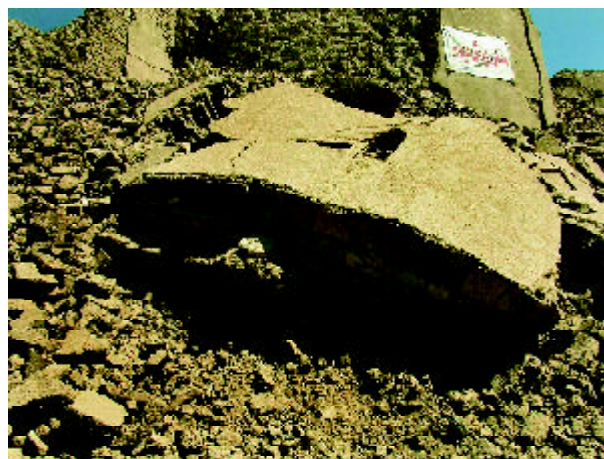
Figure 22. Collapsed section of the main gateway showing imbedded timber reinforcement of the Khesht wall.

Ensuring stability in earthquakes of earthen structures like those in Bam is clearly more difficult without the timber that was available in Turkey, Kashmir and other regions. The more lush sections of Northern Iran are reported to share the timber-laced building tradition found in Turkey, but in dry deserts of southern Iran people do not have the luxury of using extensive amounts of timber, but the date palms logs were sometimes imbedded into the walls as well as used to support floors (Figure (22)).