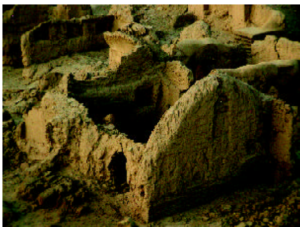
Figure 11. Unrestored ruins in the Konari neighborhood of the Arg-e Bam that survived the earthquake with comparatively little damage.

The unmodified and restored structures included most of those in the north-west section of the walled town known as the “Konari” neighborhood, and also those structures just outside of the Arg to the north-east including the tall “Shahrbast Wall”, (Figures (3) and (20)) located near the icehouse, and the “Khale Dokhtar”, (Figure (28)) located on the opposite riverbank to the north. Some of these surviving unrestored structures are of considerable size and height, and were undoubtedly subjected to shaking of close to the same characteristics as the rest of the Arg, but they remained standing, except for some smaller parts that broke off (Even in these few collapsed sections in the Khale Dokhtar and other structures, termites were also in evidence), see Figures (3), (11), (20) and (27).