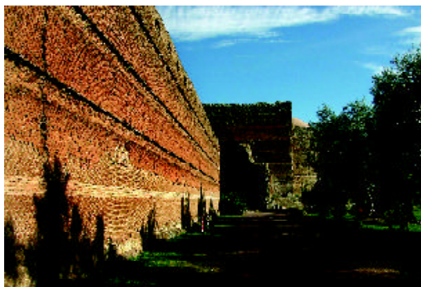
Figure 25. Long Wall, Hadrian's Villa near Rome showing the bands of brick that were laid into a wall constructed with natural cement with a tile facing. The crevices are the result of the later chipping out of the bricks for re-use.

shown a remarkable durability, but one feature in many of these walls stands out. Every meter and a half or so was a horizontal band of fired brick masonry that extended through the walls. The early Roman bricks were essentially a flat thin tile. The original purpose of these bands is not known from any literature source, and archeologists often differ in their interpretations, but it is clear that they did function as “crack stoppers”. By interrupting the uniform matrix of the natural cement with the bedded layer of bricks in mortar, the inevitable cracks that occurred in the cement layer were interrupted, giving added stability to the walls, see Figure (25).