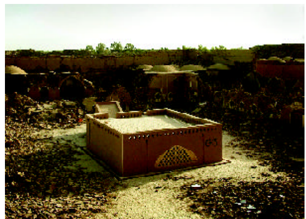
Figures 9 and 10. Before (November 2003) and After (April 2004) of the same view of the Stables courtyard showing the superstructure over the cistern that was recently reconstructed in fired bricks.