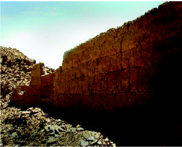
Figure 5. Chineh wall inside the Arg-e Bam that was only slightly damaged in the earthquake.

buildings that were less than thirty years old [4]. For five decades prior to the earthquake, the Arg was an archeological museum. At the time of the earthquake, which occurred at 5:27am, only three people were sleeping in the Arg complex. The two guards sleeping in the gatehouse were killed, but the chief conservator, who was sleeping in the archeology office in the Arg, was rescued from under the rubble. Had the earthquake happened during the daytime, there undoubtedly would have been more fatalities in the Arg.