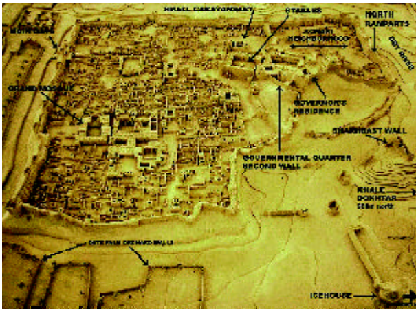
Figure 29. ICHO model of the Arg-e Bam after recent restorations prior to the earthquake.

in mortar clad with cut stone. The lesson that can be learned from this event is that for ancient buildings, structural design and construction practices are part of an integrated system, not separate or unrelated features. The hidden parts of the ancient walls are every bit as important as what can be seen on the surface. Illustrative of this fact, the pre-modern builders most likely understood the importance of the simple concept of crack-stopping since it was one of the few measures that they had at their disposal to improve the stability of the ancient construction in the desert environments.