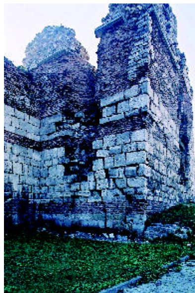
Figure 26. Surviving portion of the original Istanbul city walls. The cracks and broken section pre-dated the 1999 earthquake.

The next tower, see Figure (26) - despite its heavily decayed and cracked condition - remained standing. The surviving ancient tower had horizontal brick bands that extended through the rubble stone core of the wall. The restorers of the new tower only placed the brick bands on the surface of the wall as a veneer, constructing the tower with thick walls of rubble set