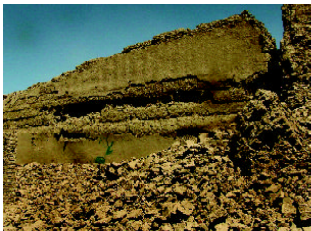
Figure 24. South-facing outside wall of the stables courtyard showing how the layering of the chineh walls has interrupted the cracking and collapse of sections of the wall, thus helping to maintain the stability of the partly undermined upper part of the wall.

This differs from Northern European cob construction, which lacked such clearly defined horizontal interfaces between the lifts. There may have been a number of reasons for this construction detail in chineh, such as water shedding, but one