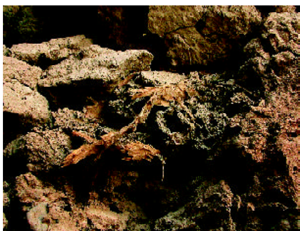
Figure 12. View of section of earthquake-caused collapse showing timber consumed by termites.

Termites live in earth and feed on organic material - that is, the same kind of cellulose that is frequently used to reinforce adobe bricks and the earth stucco used in earthen construction. Thus, the concentration of termite passageways in the interface between newer and older construction appeared to have weakened and separated the different layers of construction.