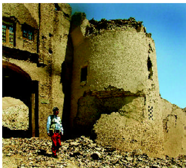
Figure 15. One of the few surviving turrets has a room in its base, as shown by the ground floor window. The floor diaphragm timbers extend through the walls, and are now visible after the stucco fell off. The collapsed masonry and stucco is from what appears to be a modern-day modification of the shape of the tower in the tradition of Viollet-le-Duc. The tower's original surface underneath is intact.

For example, in the case of (1) the first observation, the particular vulnerability of the circular turrets may be explained by the fact that they had contained large amounts of unconsolidated fill in their bases. One of the few that survived is to the right of the 2nd gate (Figure (15)), and it has a timber floor diaphragm with timbers penetrating the walls located beneath the upper windows, with a room, rather than solid fill, below. The absence of the fill, combined with the effectiveness of the floor diaphragm may have been instrumental in holding it together.