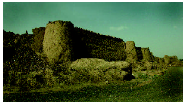
Figure 18. North-facing ramparts that were significantly less damaged in the earthquake than the other city walls. Notice that the crenellations are still intact on this one section, the only section where that was observed to be the case.

As for the better behavior of the north-facing ramparts compared to the other city walls (6), the subsurface soil conditions along the riverbank where the wall is located may account for some of this difference because the alluvial soils may have served to damp out some of the vibrations, rather than intensify them, as is often the case with earthquakes where the epicenter is farther away. Further research is needed to determine whether this may be one explanation. Also, like the nearby Konari neighborhood, these walls had not been altered and restored along their tops as much as had the other walls around the Arg. It was the newer restored upper level battlements, walkways and crenellations that consistently suffered the most, possibly because of the different densities and vibration response of the new and old material and the additional weight.