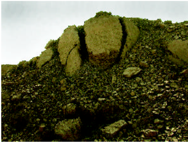
Figure 16. Collapsed round turret on the ramparts that shows evidence of having burst apart from collapse of internal layers.

In the case of (2) the collapse of the structures at the top of the hill (Figure (1)), this seemed to be caused in part because the failure of the retaining walls and fill that had been constructed up from the lower hillside to widen the platform at the top of what had originally been a narrow rock outcropping. The failure of (3) the walls of many of the buildings and ramparts was also consistent with the lateral spreading of the material in the cores of their walls, with the exterior adobe bricks being forced out as manifested by the greater frequency of vertical cracks as compared to diagonal cracks, see Figure (16) and (17).