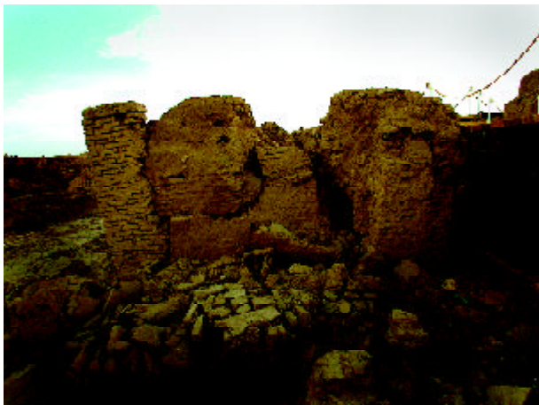
Figure 17. A massive pier composed of different periods and types of Khesht and chineh construction that have separated from each other during the earthquake.

In the case of (4), the collapse of the domes throughout the complex, many simply may have followed their bursting supporting walls to the ground. Others which collapsed inward, like that of the