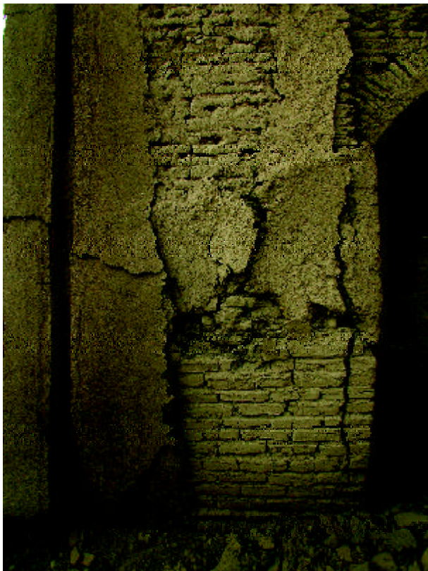
Figure 8. Pier in a partially collapsed section of the Caravansary showing the bursting of the outer layers from internal expansion from the earthquake vibrations.

Most intriguing and significant, perhaps, are (8), those structures that had been maintained and