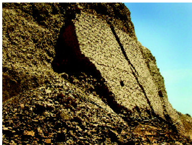
Figure 7. View of collapsed outer walls of a round tower. The Khesht construction of the outer layer has fallen off of the earlier inner layers that are most likely a combination of periods of building in different methods.